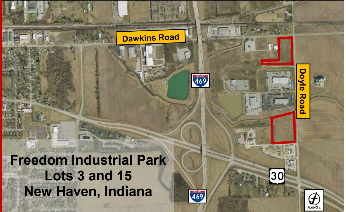
Freedom Industrial Park Lots 3 and 15 New Haven, Indiana